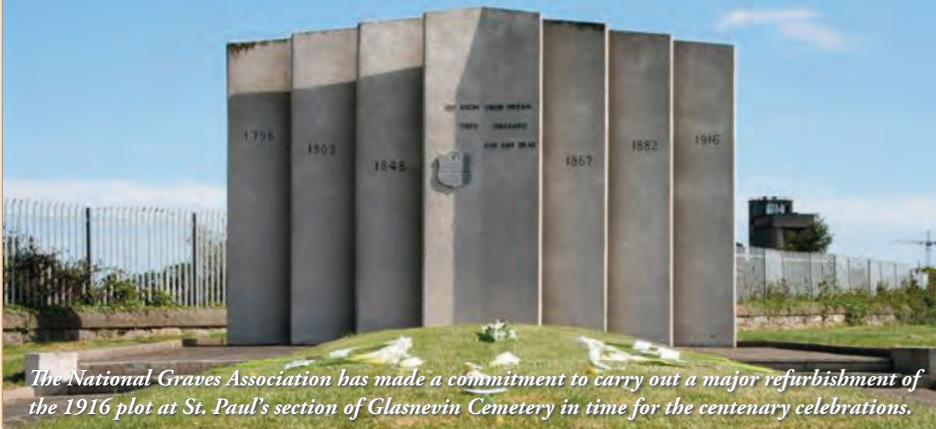
The National Graves Association has made a commitment to carry out a major refurbishment of the 1916 plot at St. Paul's section of Glasnevin Cemetery in time for the centenary celebrations.