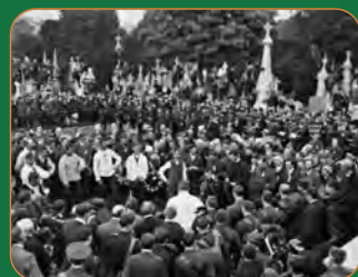
The funeral of Jeremiah O'Donovan Rossa, 1st August 1915.